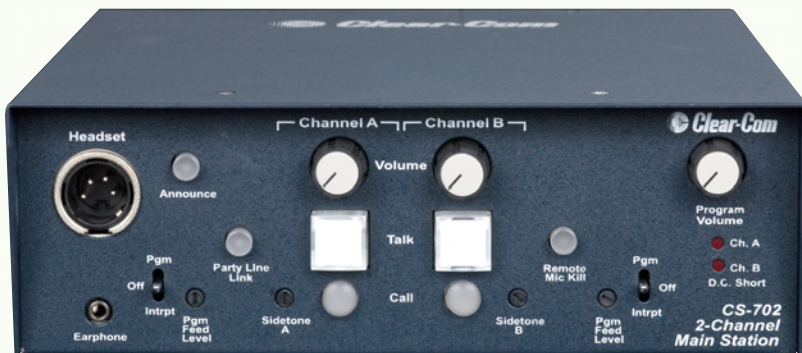
CS-702 Front Panel